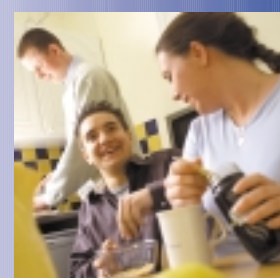
Relaxing in one of the houses

Oxford provides a wealth of historic buildings, galleries, parks and museums as well as plenty of theatres, cinemas and shops.