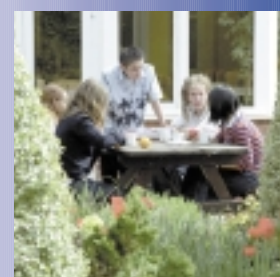
Outside the dining room