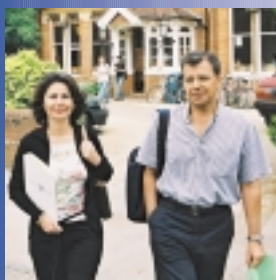
26 years providing the IB