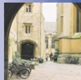
The historic university