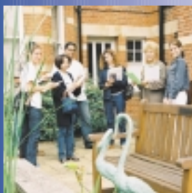
Small, informal groups